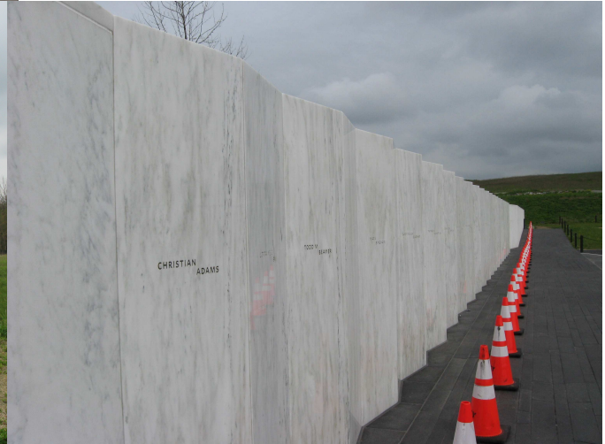
NORG Members at Fallingwater; Fallingwater; Crash Site (arrow) Flight 93; Wall with engraved names of each victim