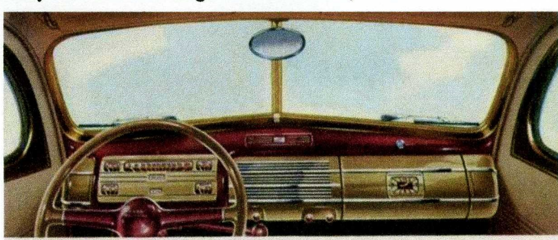
NEW DE LUXE INSTRUMENT PANEL • On this handsome, efficient instrument panel all gages are grouped in a single unit for perfect visibility through the new two-spoke steering wheel. There are two ash trays—one at each end—a cigar lighter, grille for a radio speaker, a 30-hour clock and a sturdy lock on the glove compartment.